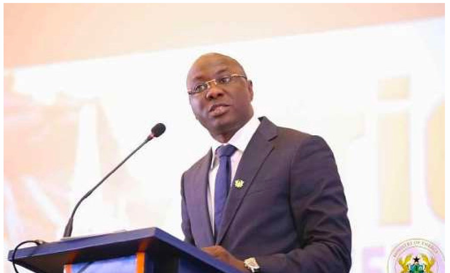
Dr. Mohammed Amin Adam, Finance Minister