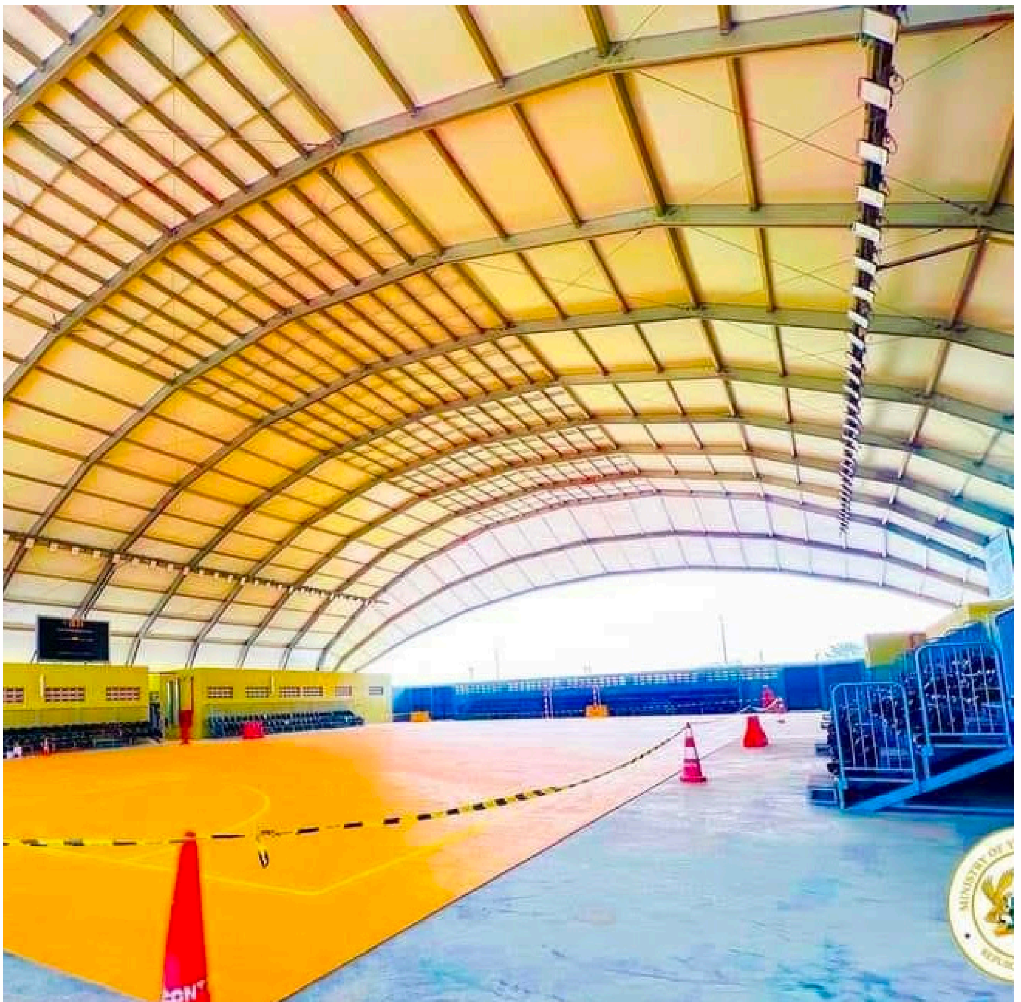
Borteyman Sports Complex