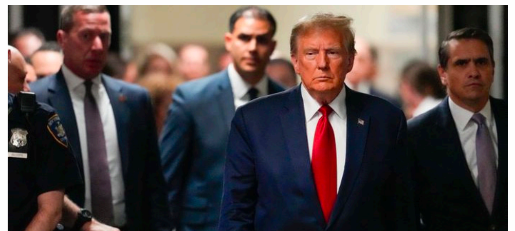
Donald Trump, Former US President