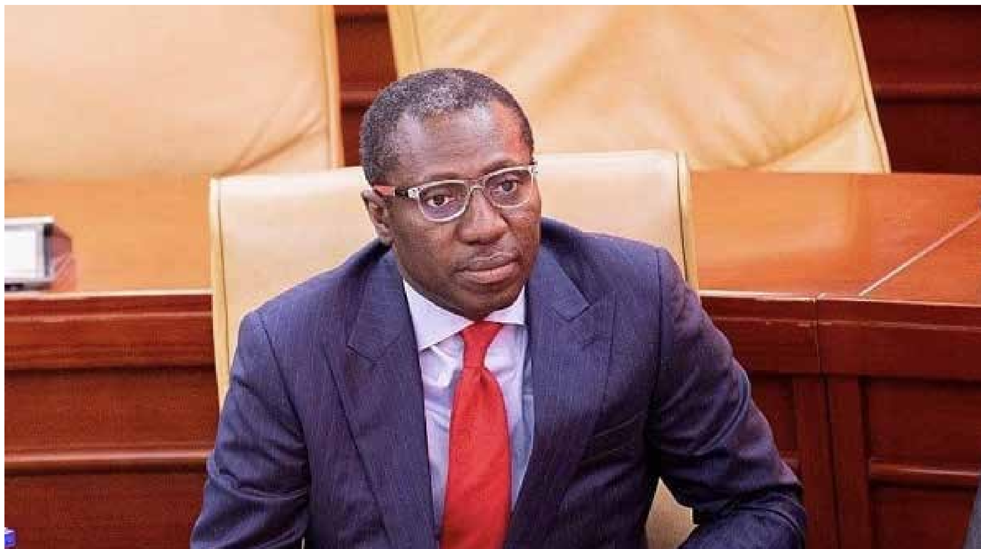
Alexander Afenyo-Markin, New Majority Leader in Parliament