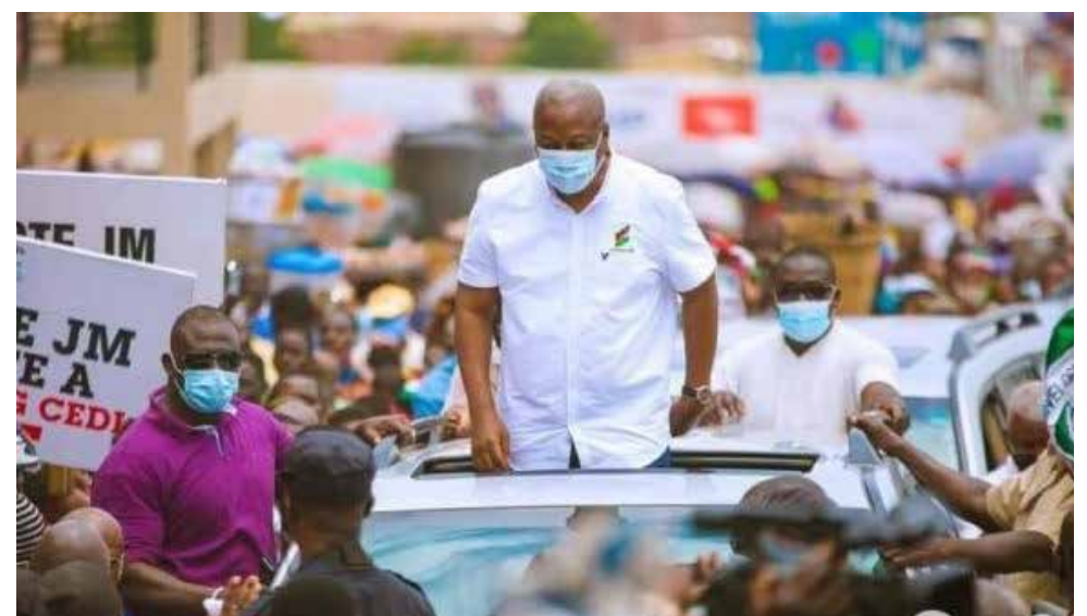
John Dramani Mahama, Flagbearer of the NDC