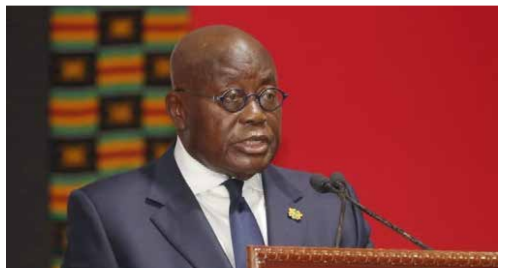
Nana Addo Dankwa Akufo-Addo, President of Ghana