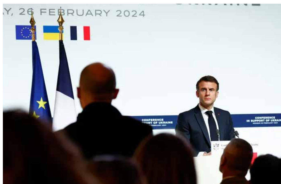
French President Emmanuel Macron speaks at the end of a conference in support of Ukraine