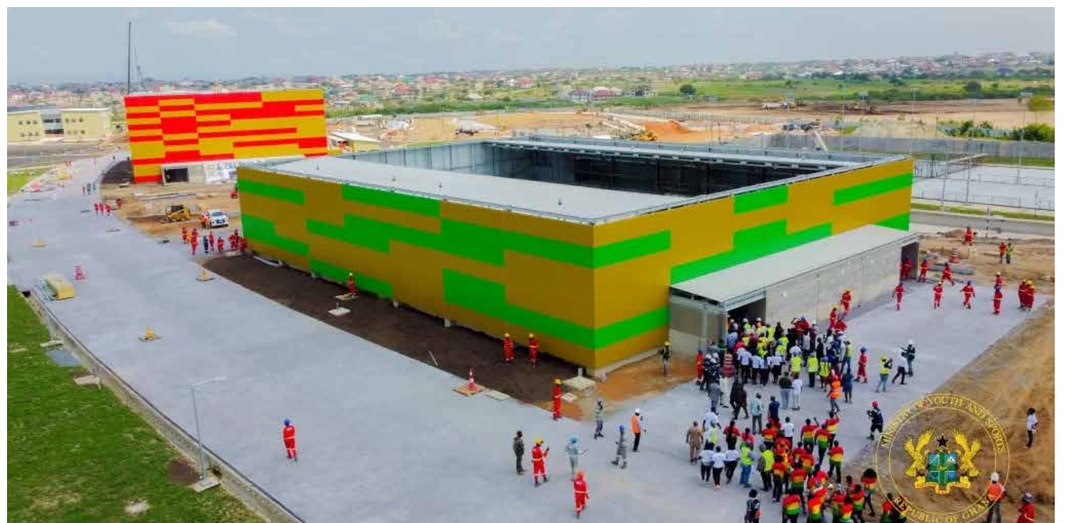
New All Africa Games Sports Complex