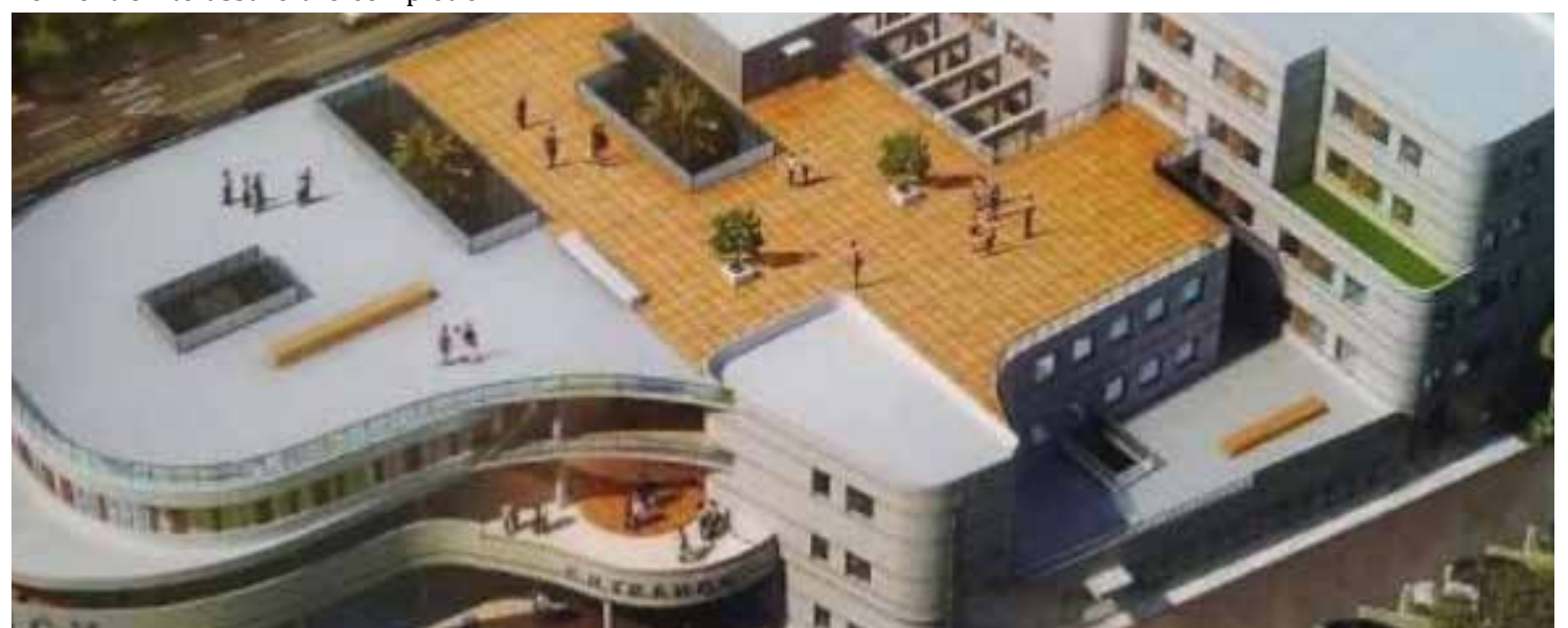
La General Hospital building plan