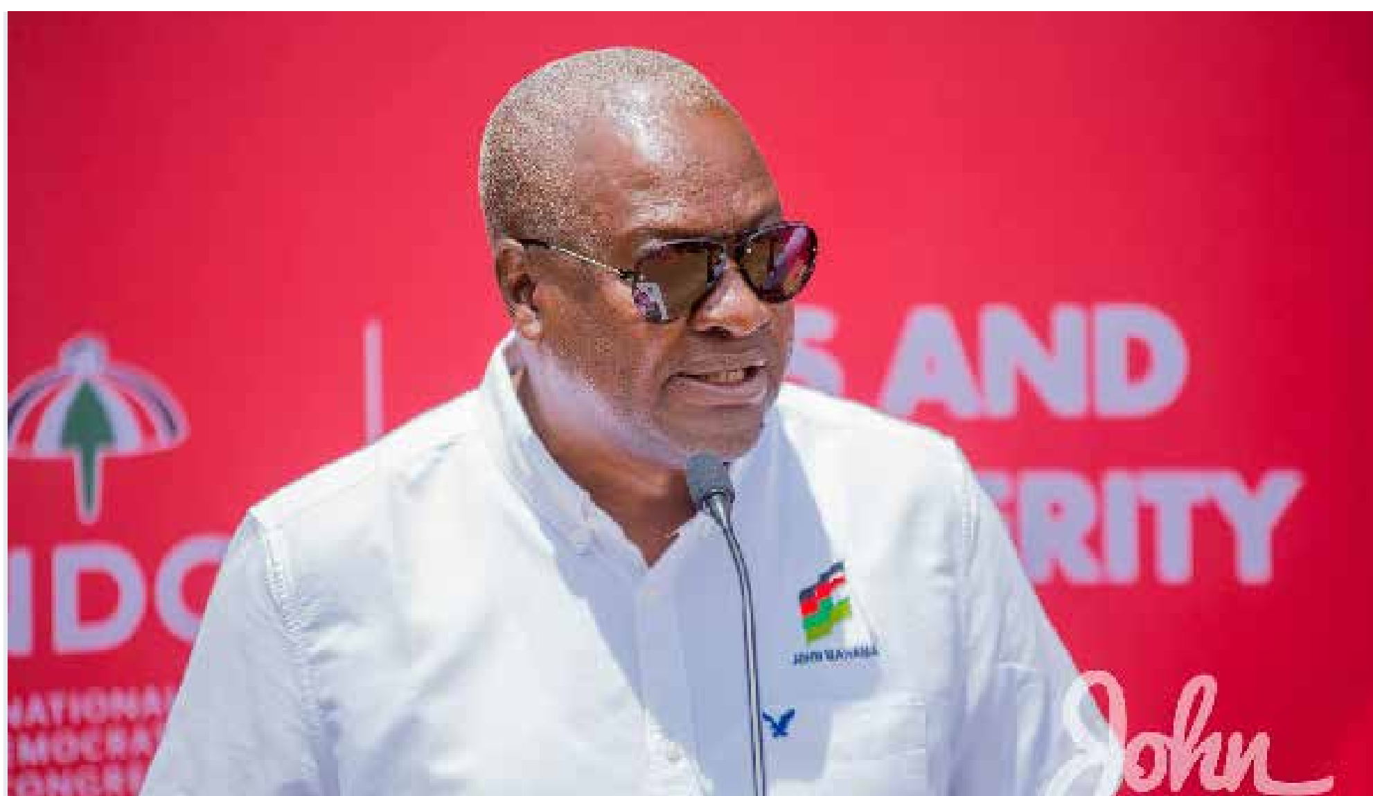
John Dramani Mahama, Flagbearer of the NDC