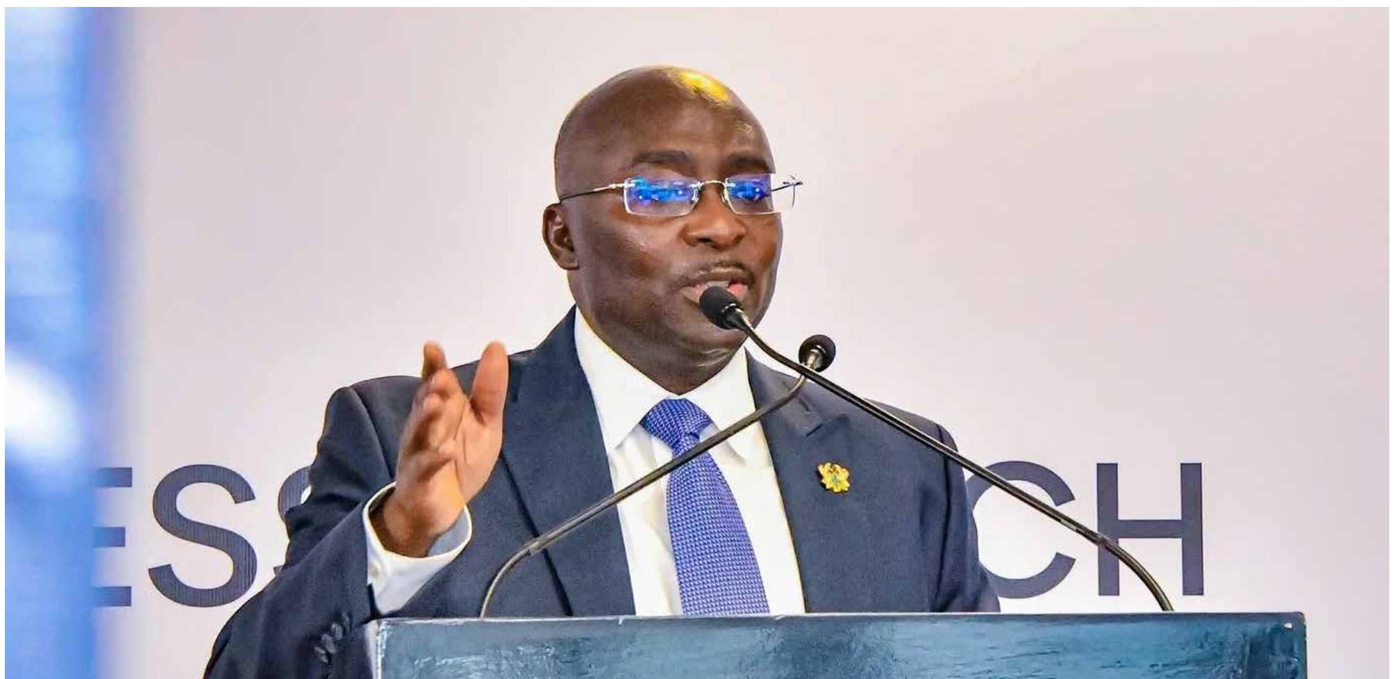
Dr Mahamudu Bawumia, Vice President of Ghana