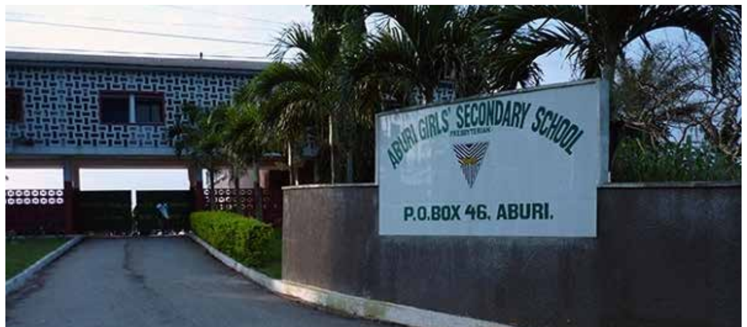
Aburi Girls SHS