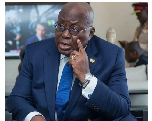
Nana Akufo-Addo, President of Ghana