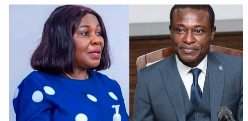
Cecilia Dapaah, Former Minister of Sanitation and Water Resources on the left & Kissi Agyebeng, Special Prosecutor