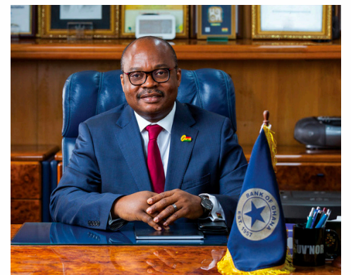
Ernest Addison, Governor, Bank of Ghana