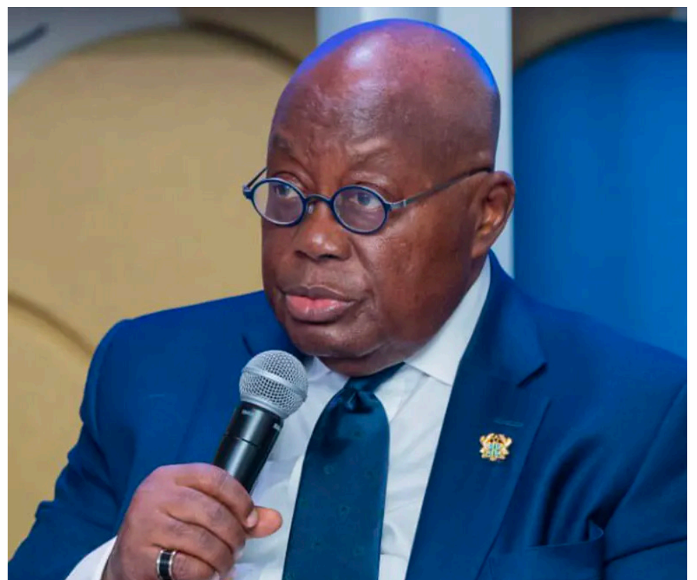
Nana Akufo-Addo, President of Ghana