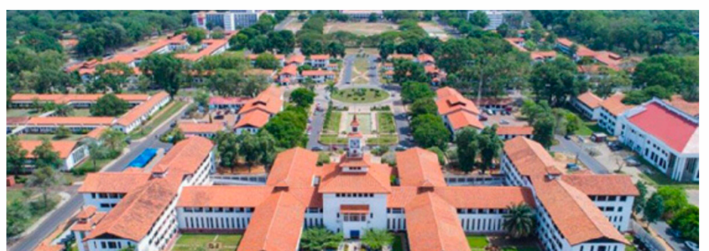
University of Ghana Legon Campus