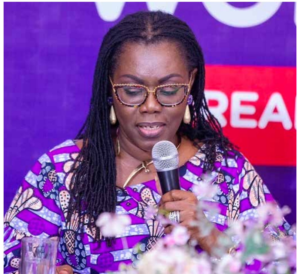
Ursula Owusu-Ekuful, Minister of Communications and Digitalization