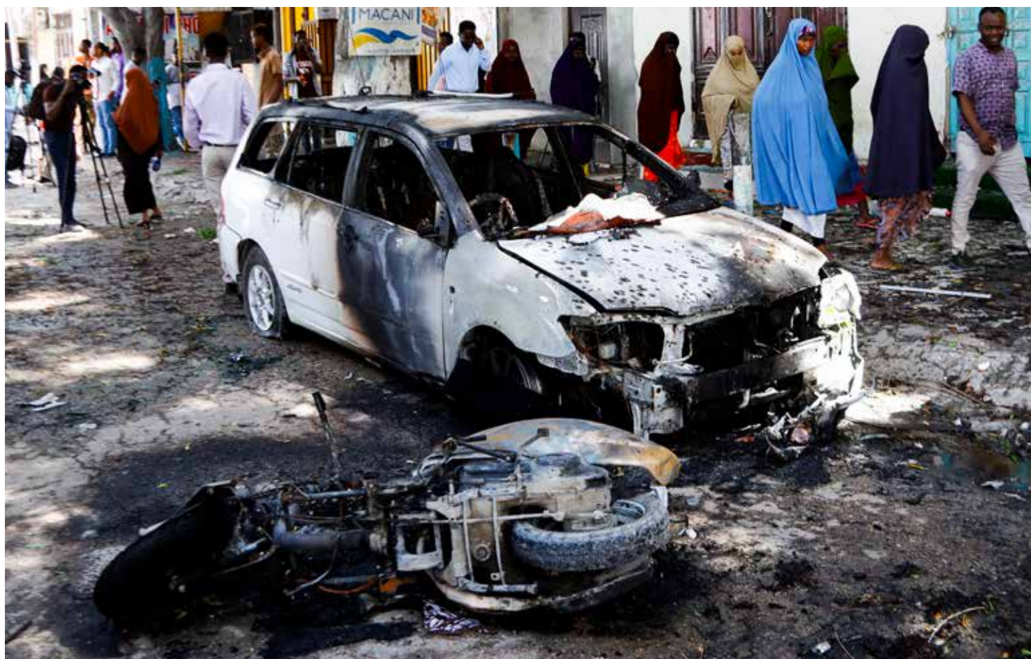
Wreckage of a vehicle destroyed at the scene of a suicide bomb blast in the Hamar Weyne district of Mogadishu