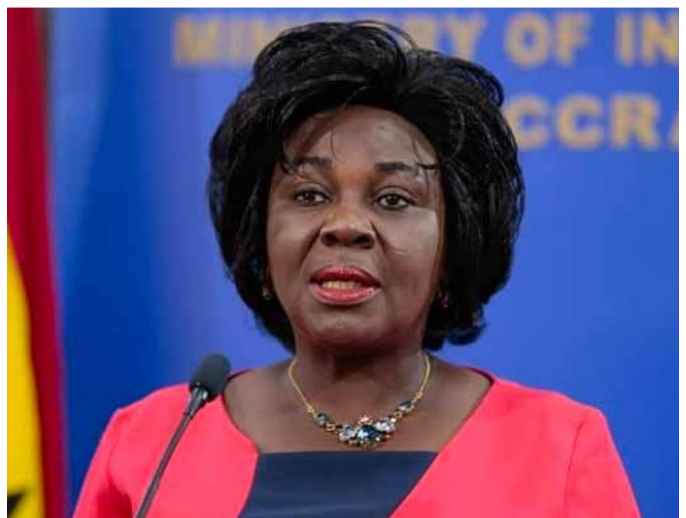
Cecilia Dapaah, Former Sanitation Minister