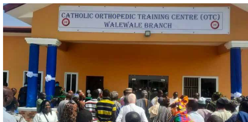
Walewale Orthopedic Training Centre