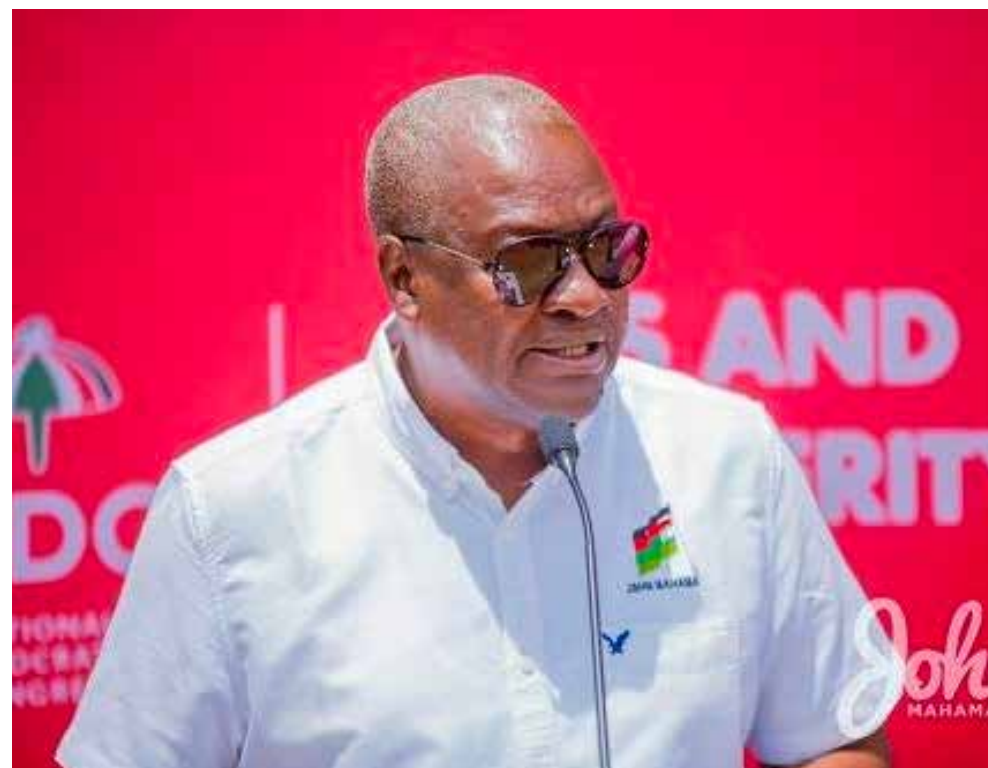
John Dramani Mahama, Former President of Ghana