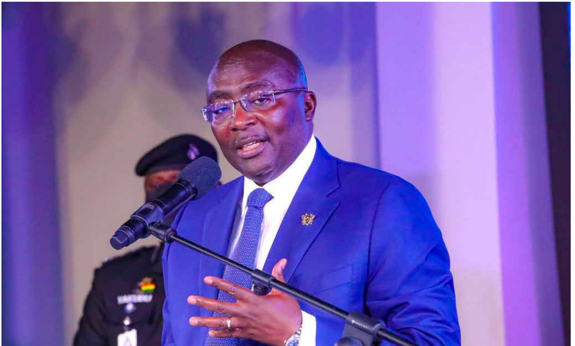
Dr. Mahamudu Bawumia, Vice President of Ghana