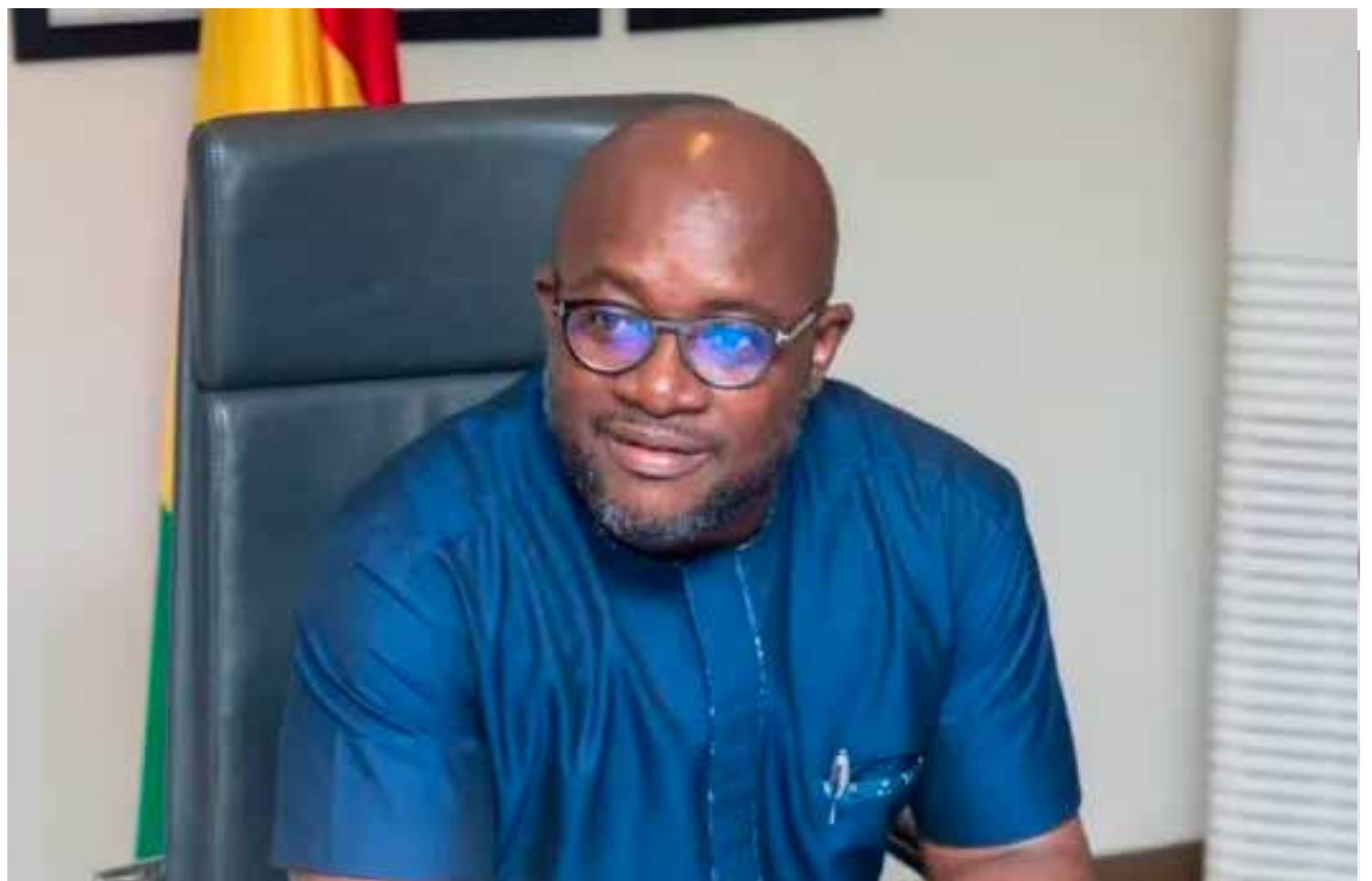
Agyapa Mercer, Deputy Energy Minister