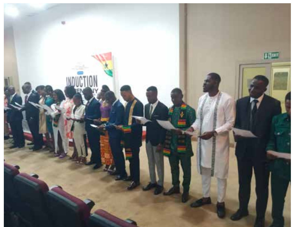
42 veterinary medicine doctors inducted