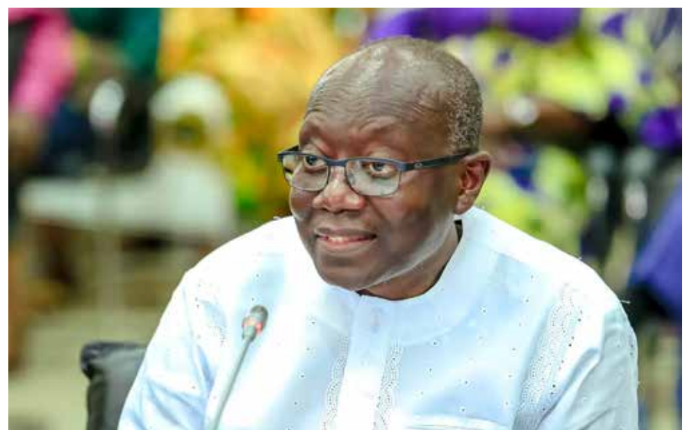
Ken Ofori-Atta, Finance Minister