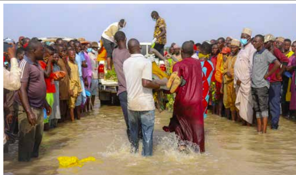
Boat accidents are common on Nigerian waterways and are often blamed on overcrowding