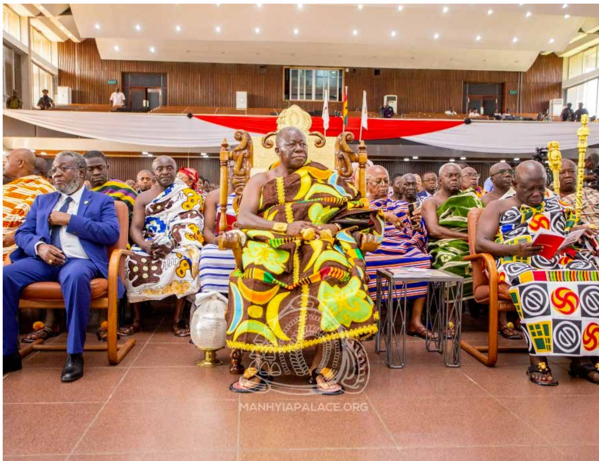
Asantehene Otumfuo Osei Tutu II, King of Asante Kingdom