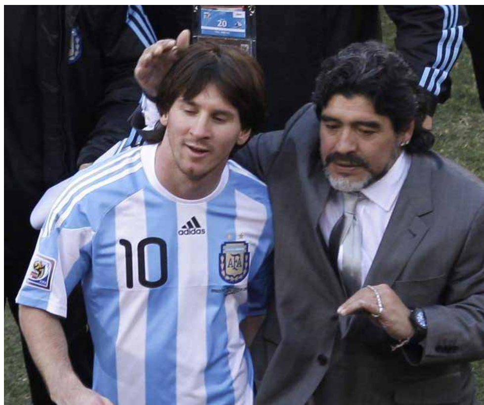
Lionel Andrés Messi and Diego Armando Maradona