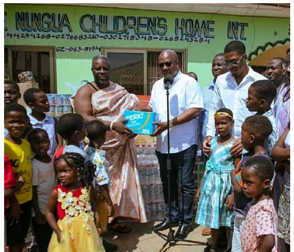
Former President John Dramani Mahama, making a donation.