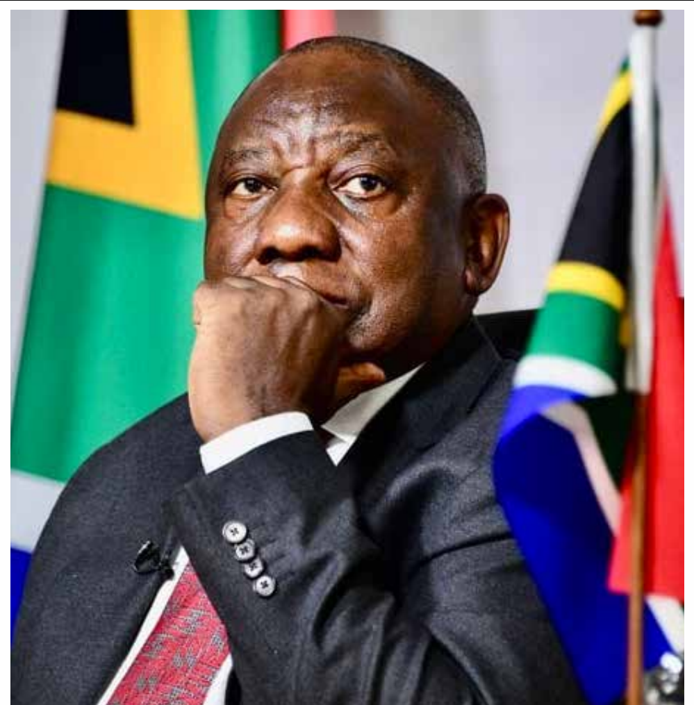
Cyril Ramaphosa, South Africa's President