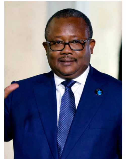
Umaro Embaló, President of Guinea Bissau