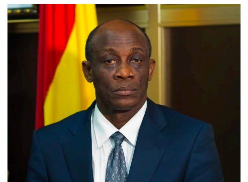
Seth Terkper, Former Finance Minister