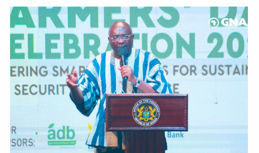
Dr. Mahamudu Bawumia, NPP Flagbearer