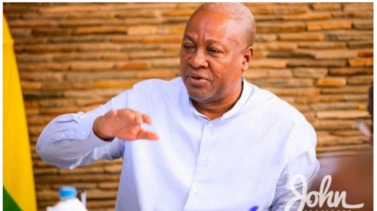
John Dramani Mahama, NDC Flagbearer

Source: The Independent Ghana/ Phoebe Martekie Doku