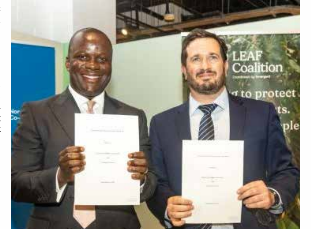
Lands Minister Samuel Abu Jinapor (L) and United Kingdom's Minister for Energy Security and Net Zero, Hon, Graham Stuart (r)

The Minister for Lands and Natural Resources, Samuel Abu Jinapor, emphasized the critical importance of forest and naturebased solutions to climate change. He highlighted how the new agreement complements other ongoing initiatives in Ghana, such