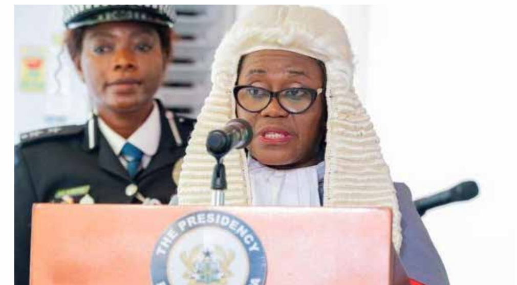
Chief Justice Gertrude Sackey Torkornoo