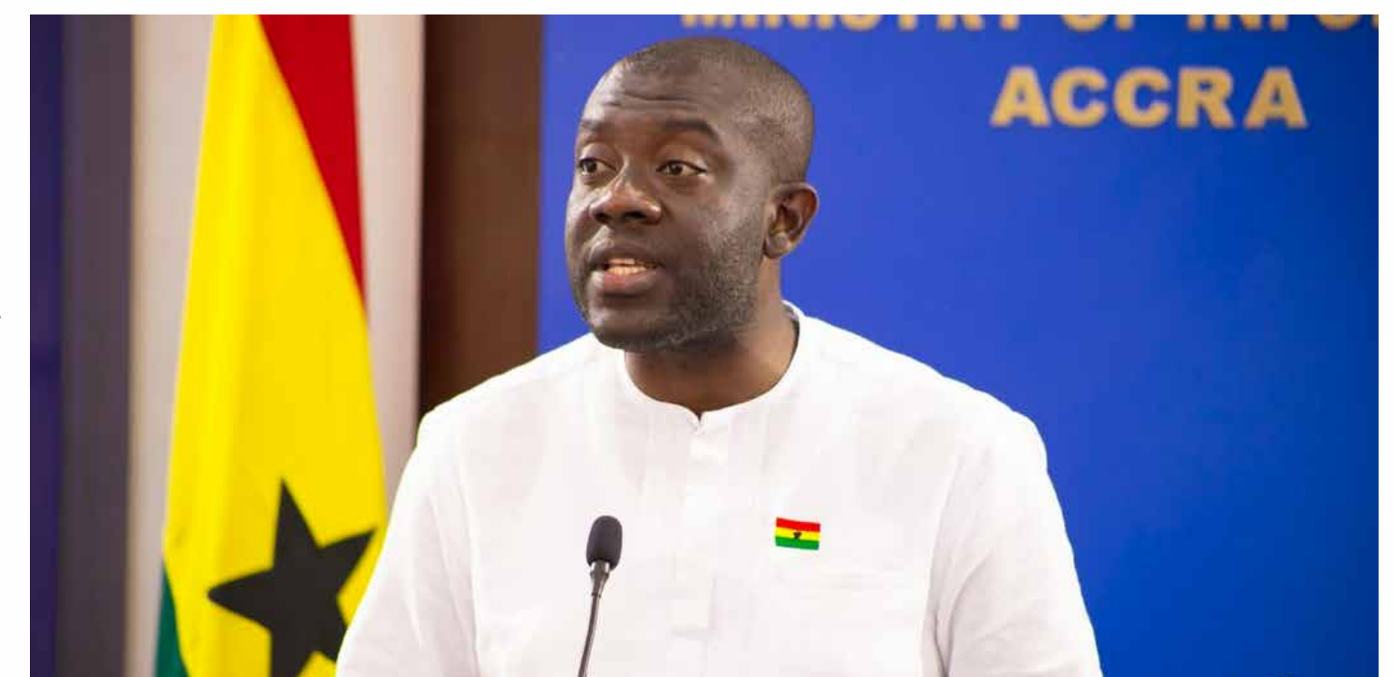
Kojo Oppong-Nkrumah, Minister of Information