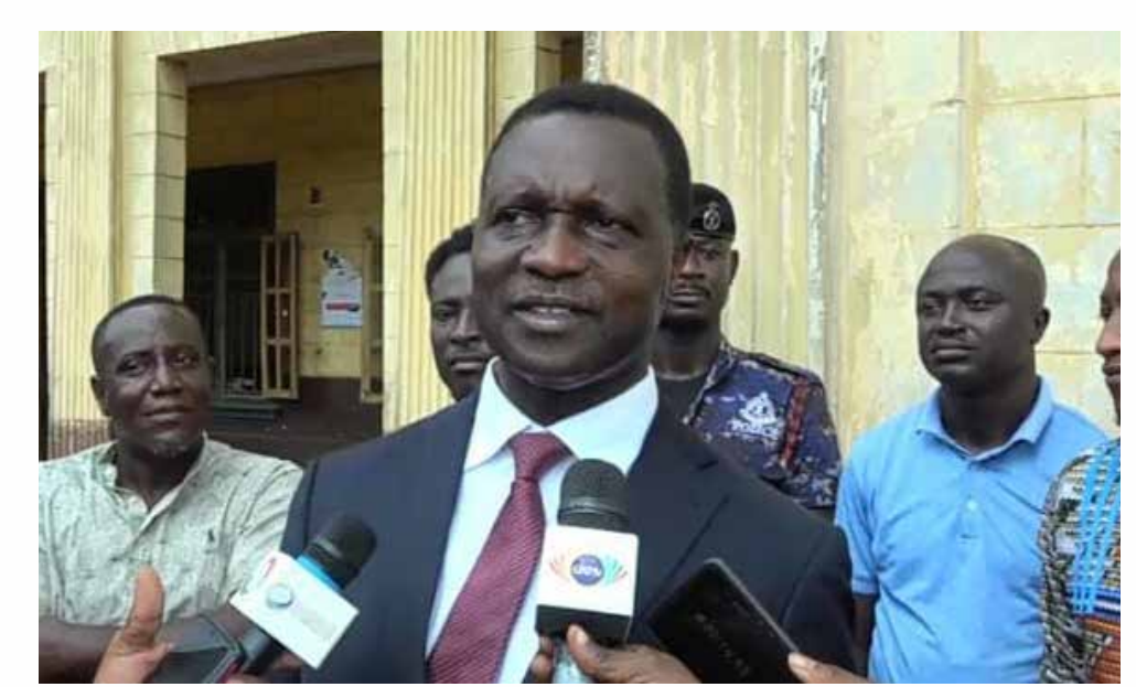
Dr. Yaw Osei Adutwum, Education Minister