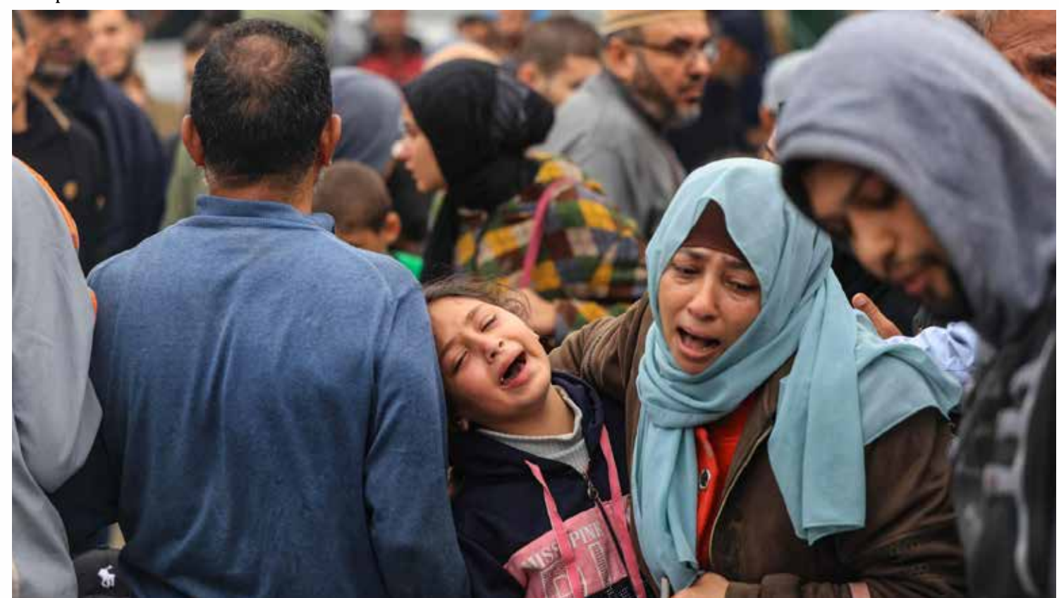
Palestinians mourn the death of loved ones following Israeli bombardment in southern Gaza, Palestine