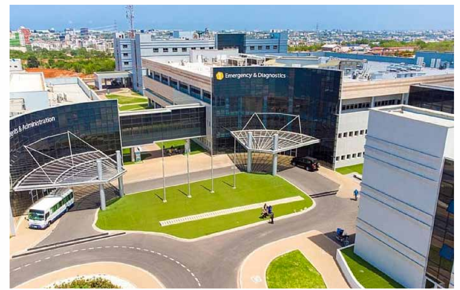
University of Ghana Medical Centre (UGMC)