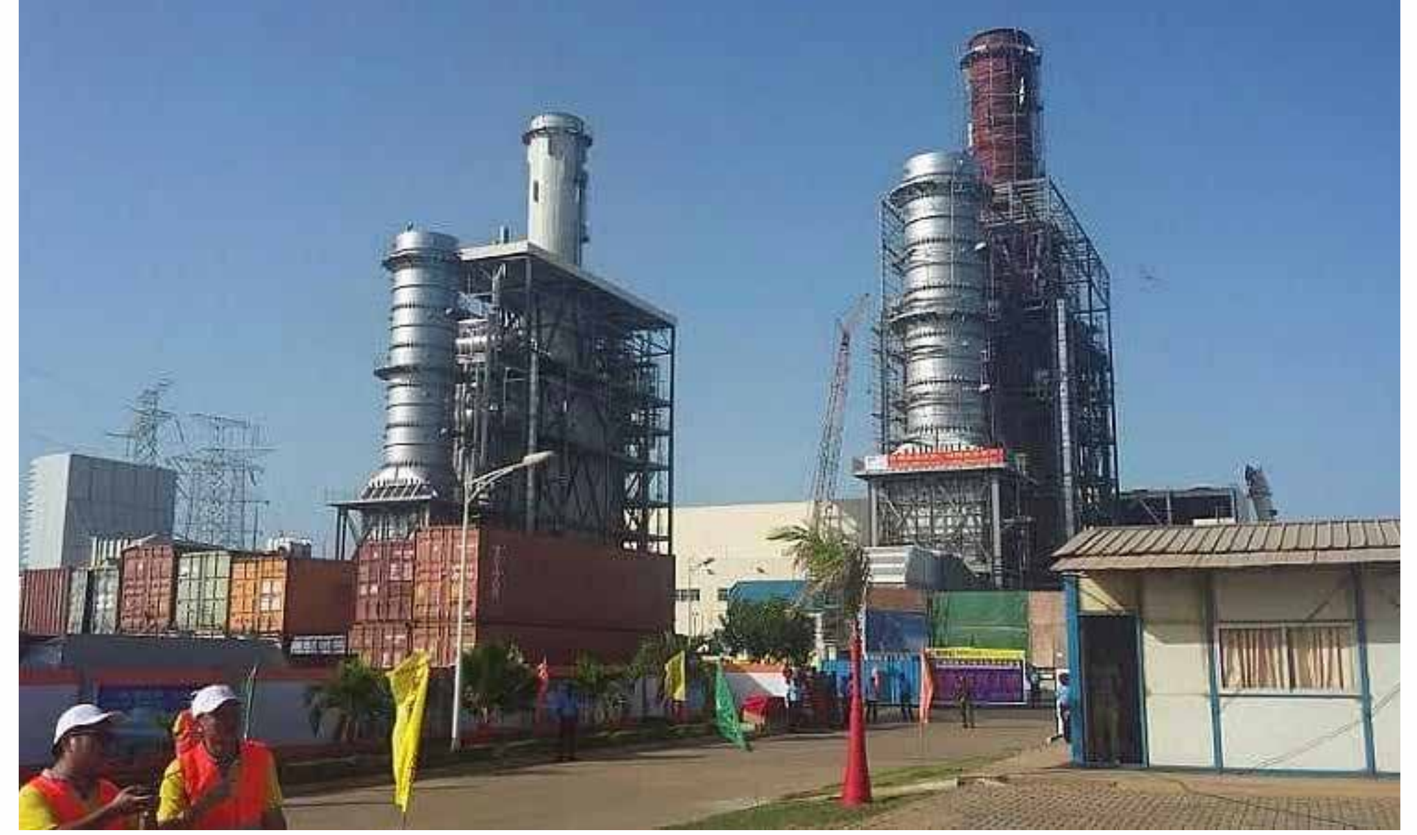
Sunon Asogli Power (Ghana)