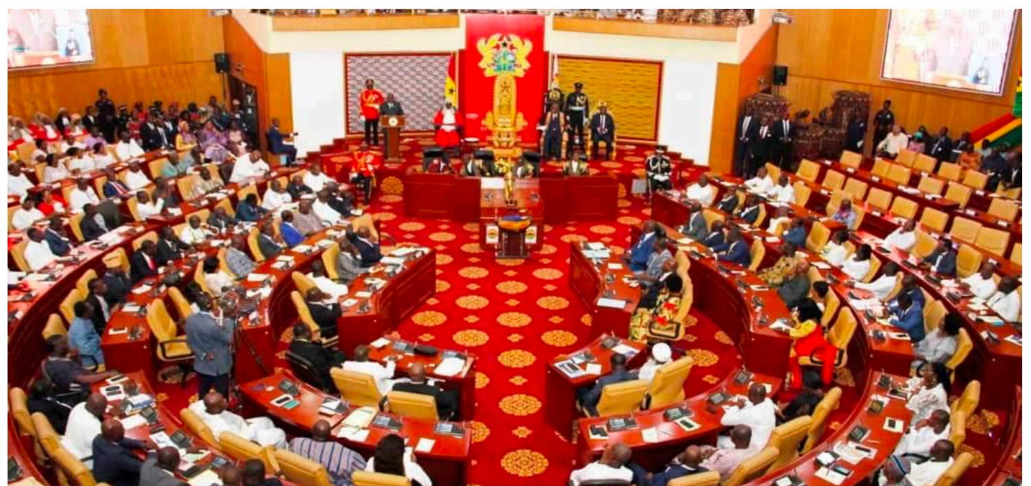
Parliament of Ghana