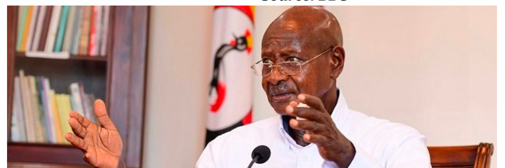
Yoweri Museveni, President of Uganda