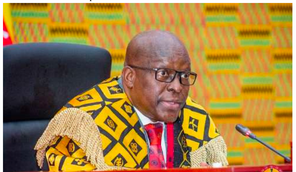
Mr Alban Sumana Kingsford Bagbin, Speaker of Parliament