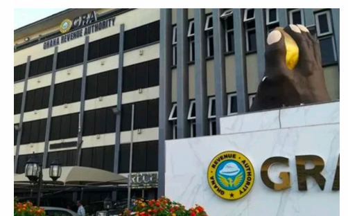
GRA Office Building