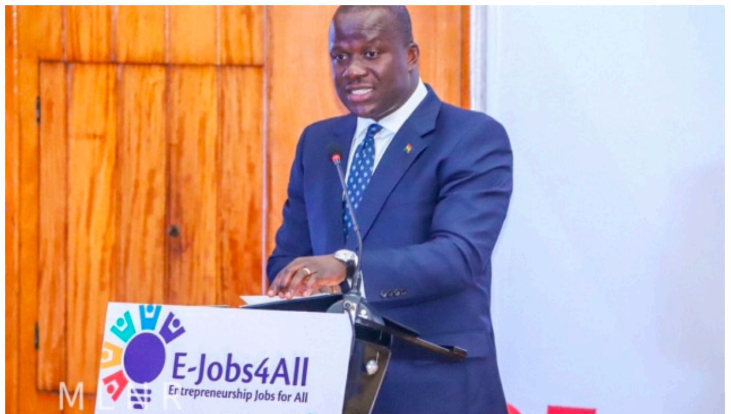
Samuel Abu Jinapor, Minister for Lands and Natural Resources