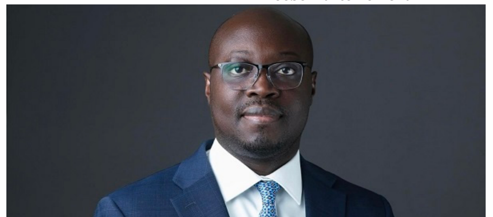
Ato cassiel Forson, Minority Leader