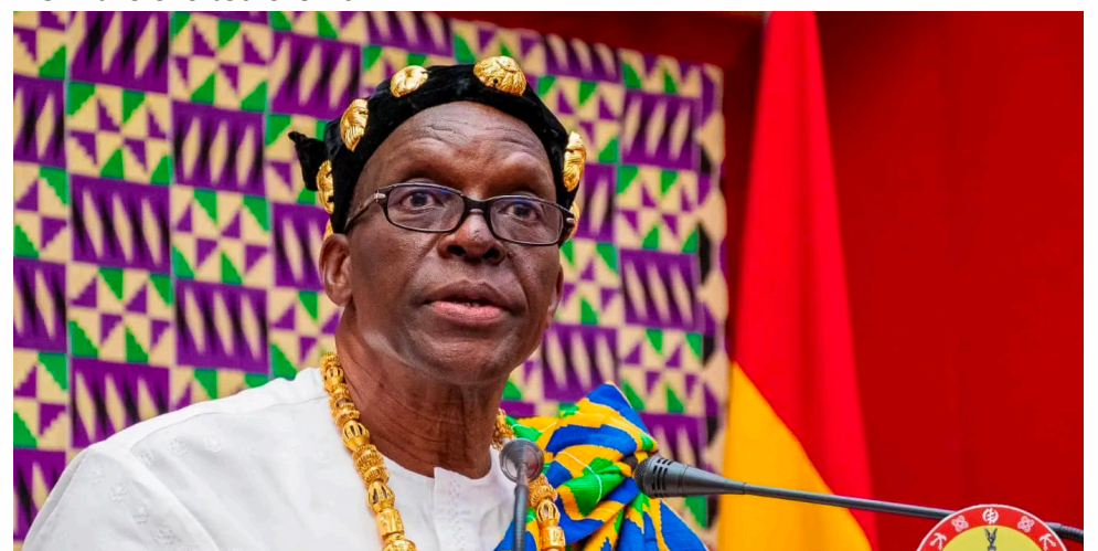
Mr Alban Sumana Kingsford Bagbin, Speaker of Parliament