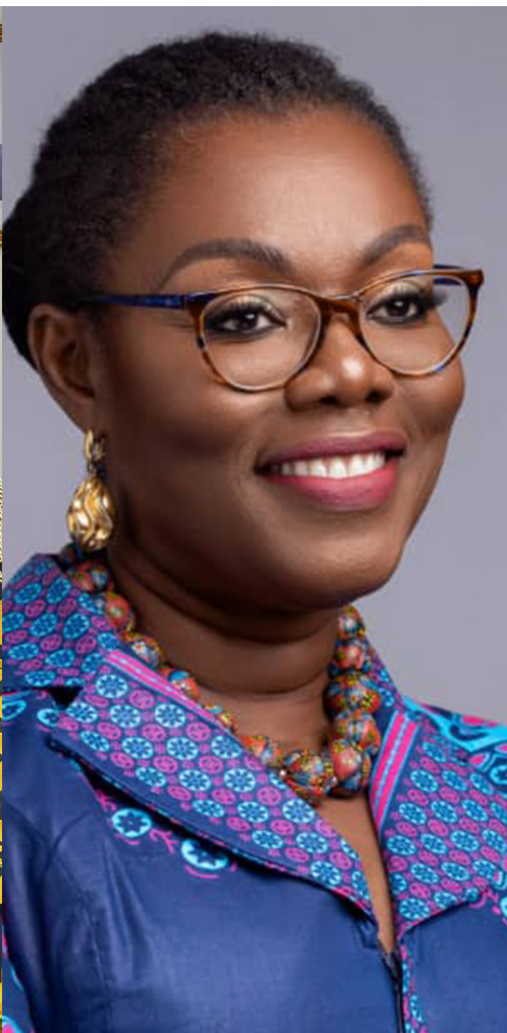
Mr Alban Sumana Kingsford Bagbin, Speaker of Parliament, on the left, Ursula Owusu-Ekuful, Minister of Communication on the right