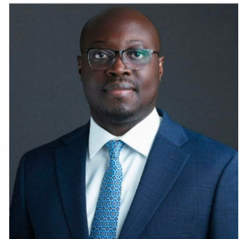
Dr Cassiel Ato Forson, Minority Leader in Parliament