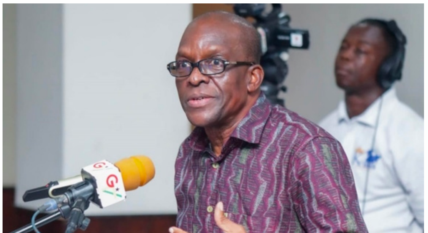
Alban Bagbin, Speaker of Parliament