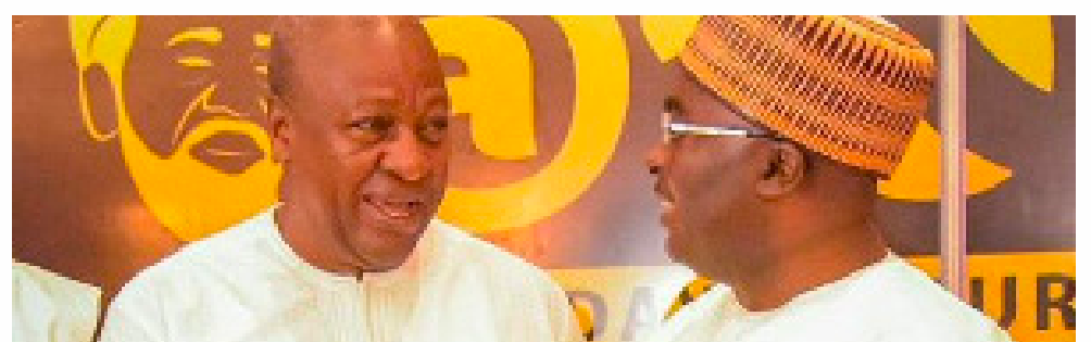
John Dramani Mahama, NDC Flagbearer, on the left, Dr Mahamudu Bawumia, NPP Flagbearer on the right