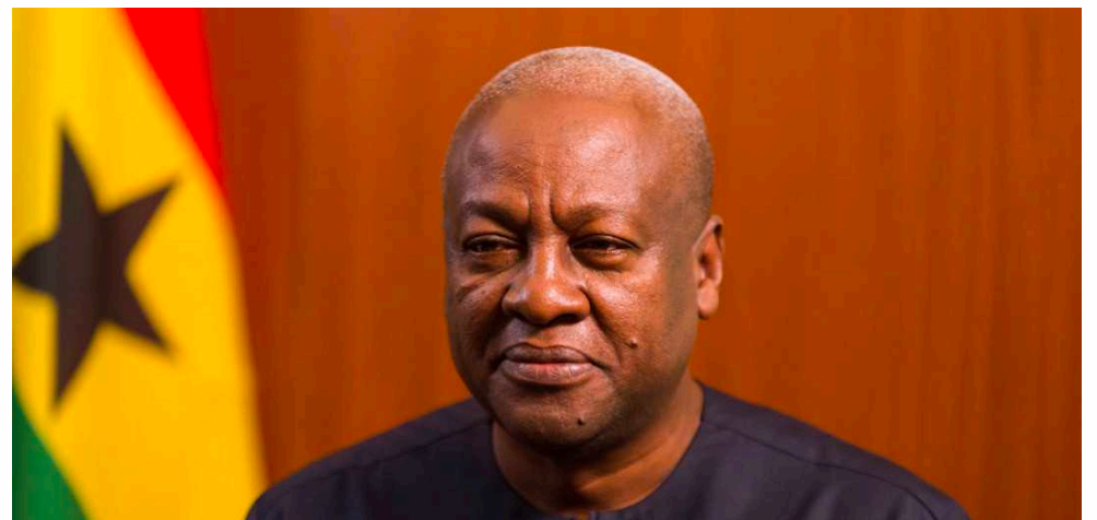
John Dramani Mahama, Flagbearer, NDC