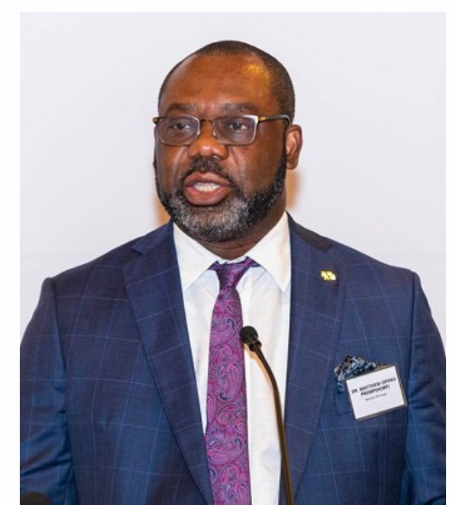
Dr Matthew Opoku Prempeh, Energy Minister