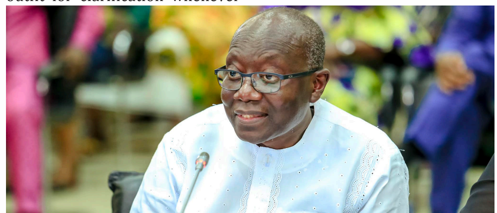
Ken Ofori-Atta, Finance Minister