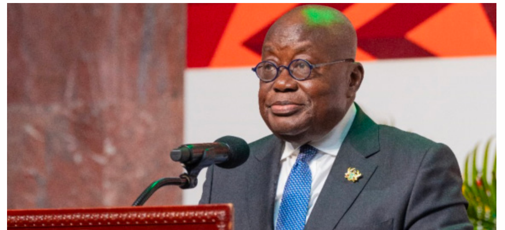
Nana Akufo-Addo, President of Ghana