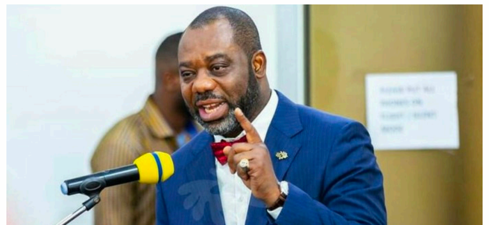
Dr Mathew Opoku Prempeh, Energy Minister