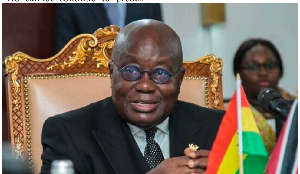
Nana Akufo-Addo, President of Ghana