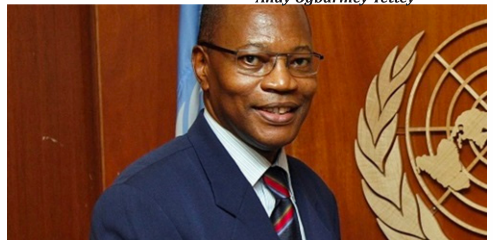
Dr Mohammed Ibn Chambas, Former UN Envoy to West Africa and Sahel Region