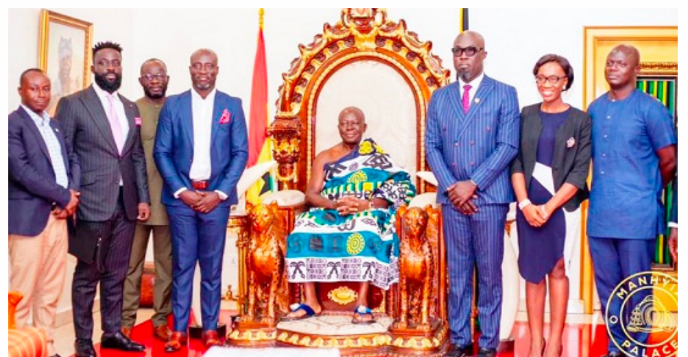
Asantehene Otumfuo Osei Tutu II & His campaign team