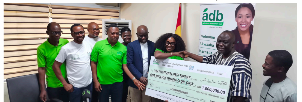
ADB Representatives makes a donation