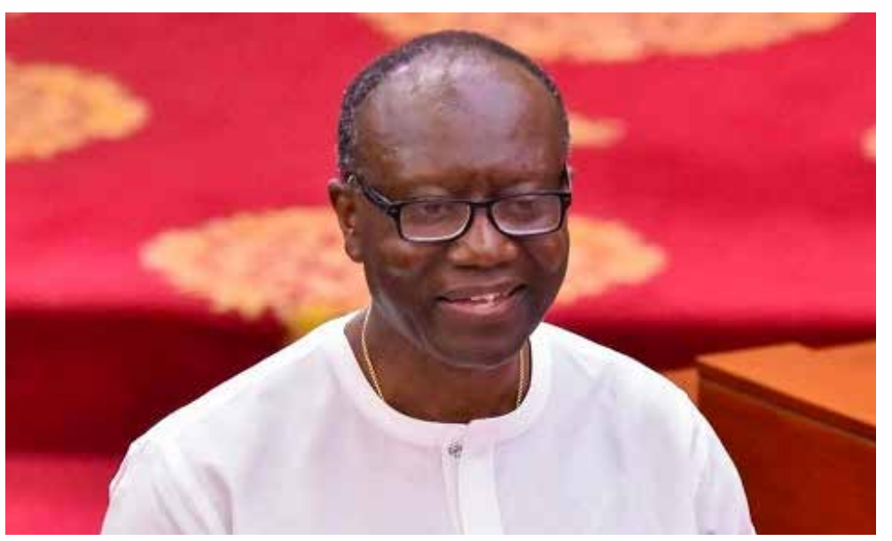
Ken Ofori-Atta, Finance Minister