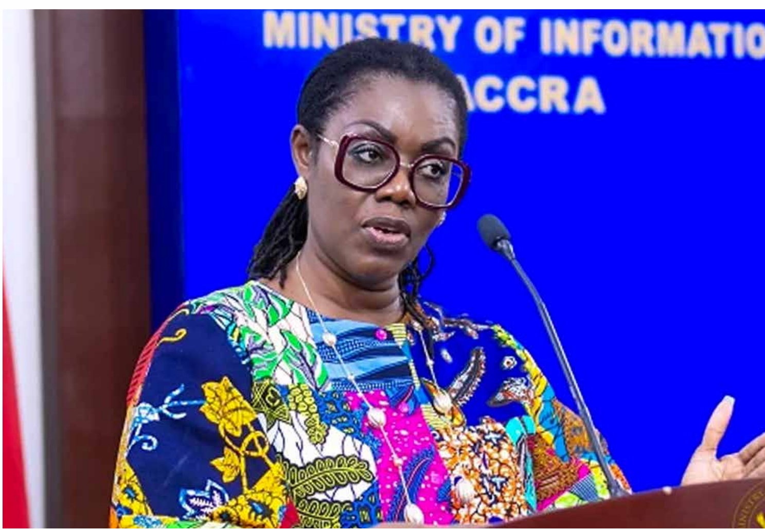
Ursula Owusu-Ekuful, Minister of Communication and Digitalization