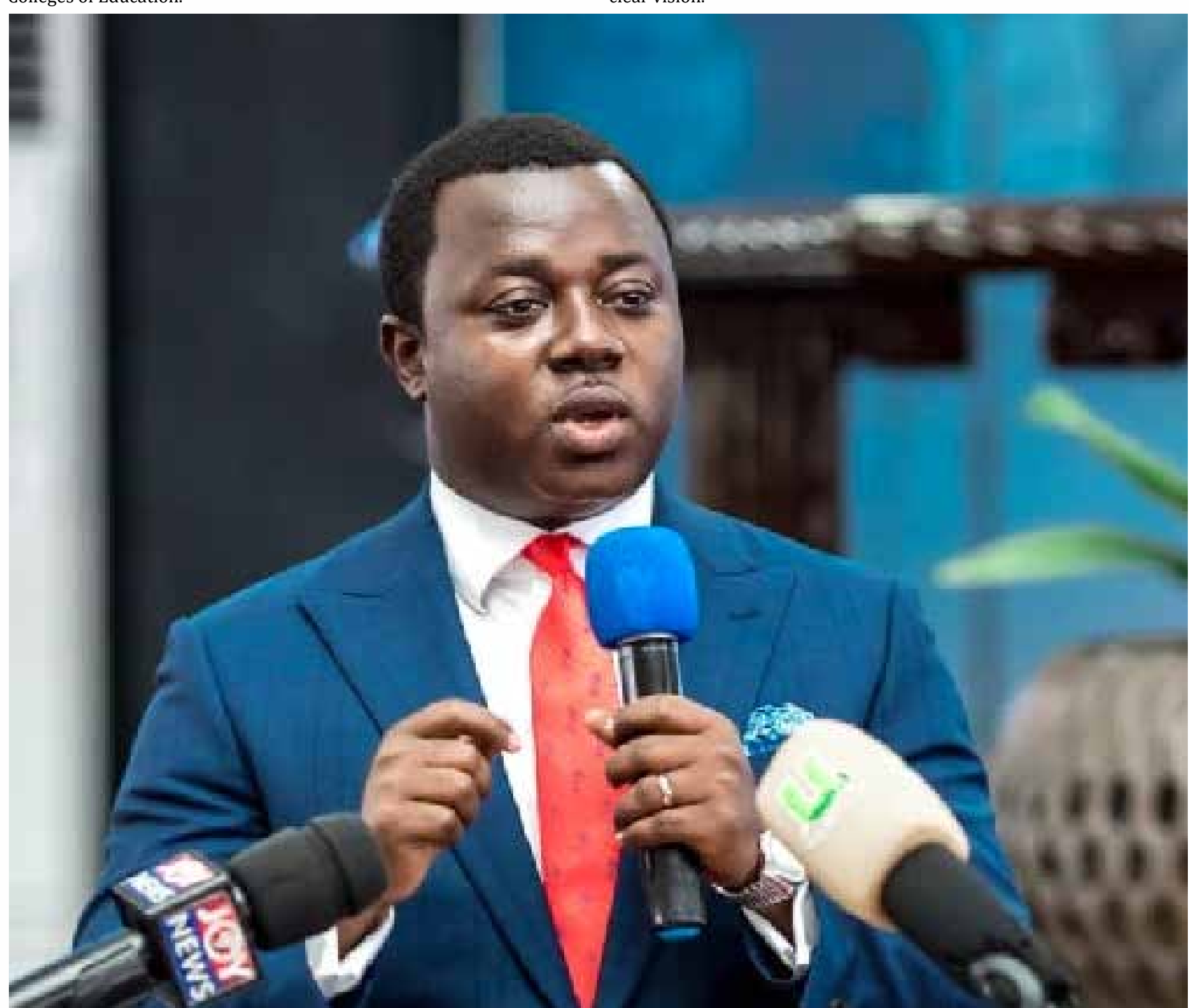
John Ntim Fordjour, Deputy Minister of Education