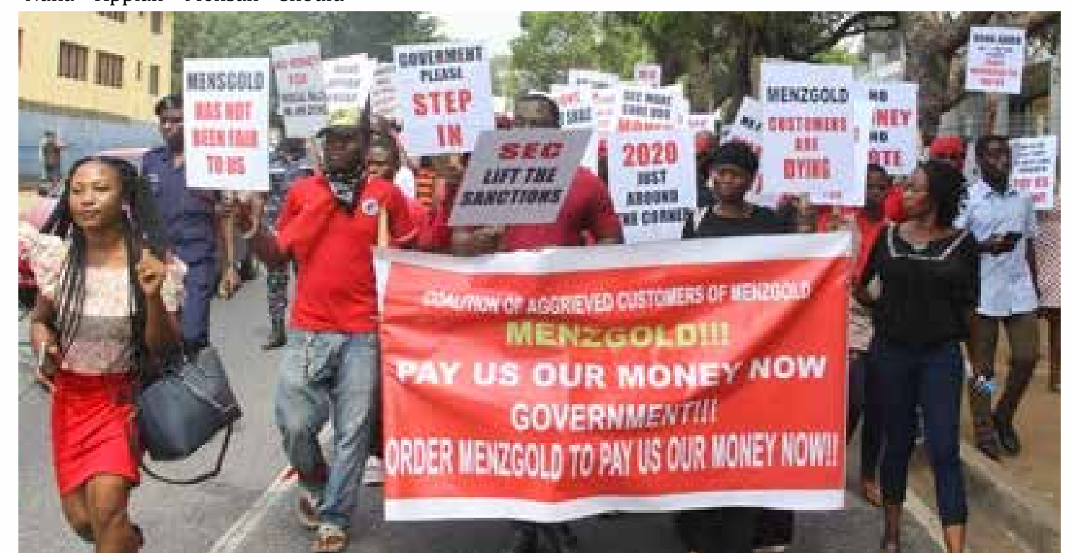
Aggrieved Menzgold customers