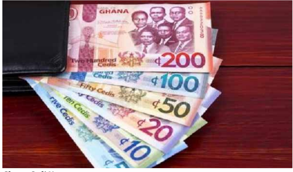
Ghana Cedi Notes